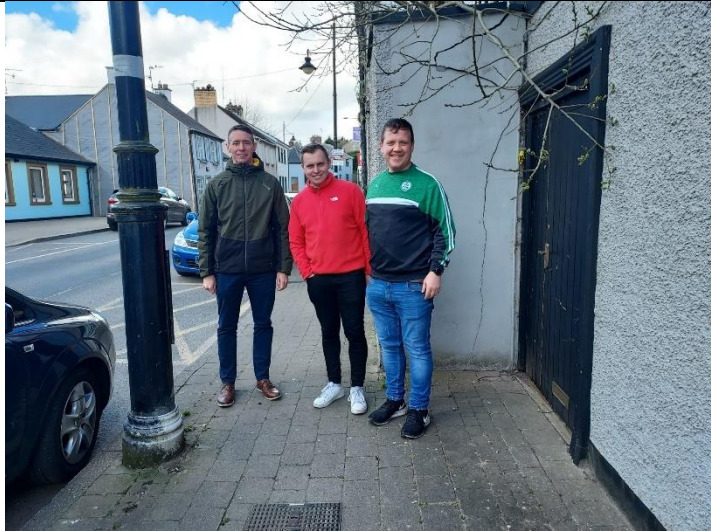
Slow Patrol – Chasing Cars in Lifford