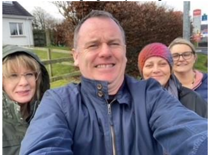
Legs of Duty – going the distance in Carndonagh