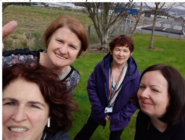
GaelGoers Leitir Ceanainn – cuma sástachta agus foircinn a dhéanamh le chéile'

Pictured are some of the photos taken by staff during their walks -