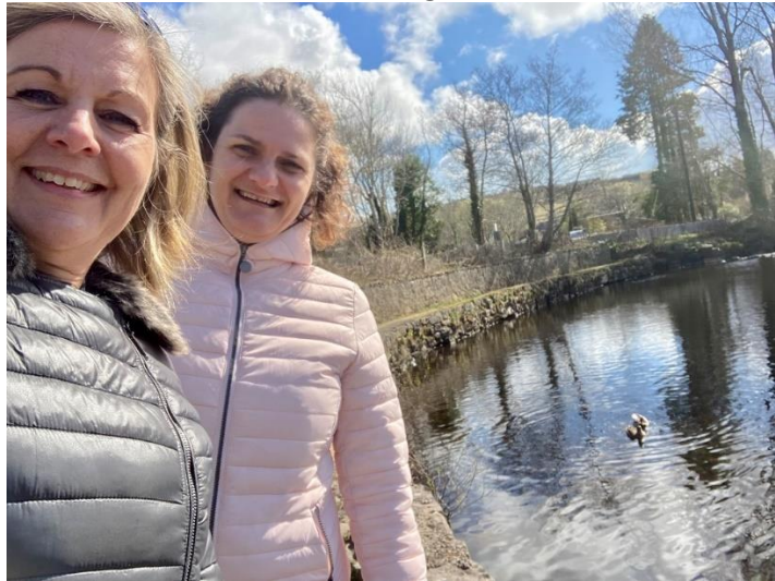
Blisters Sisters – giving it welly in Donegal Town